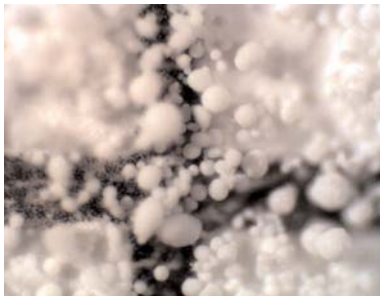
Sample 1: During the agitation stage from the wash tank.

Three samples were pulled through a 1.2 micron patch under vacuum and viewed under a microscope with 400 x magnification. The dark black lines visible are the grid-lines on the slide which allow visual comparison to actual particle size.