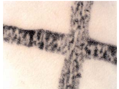
Sample 3: After final polishing using the BD6000. Slides now showing excellent clarity.